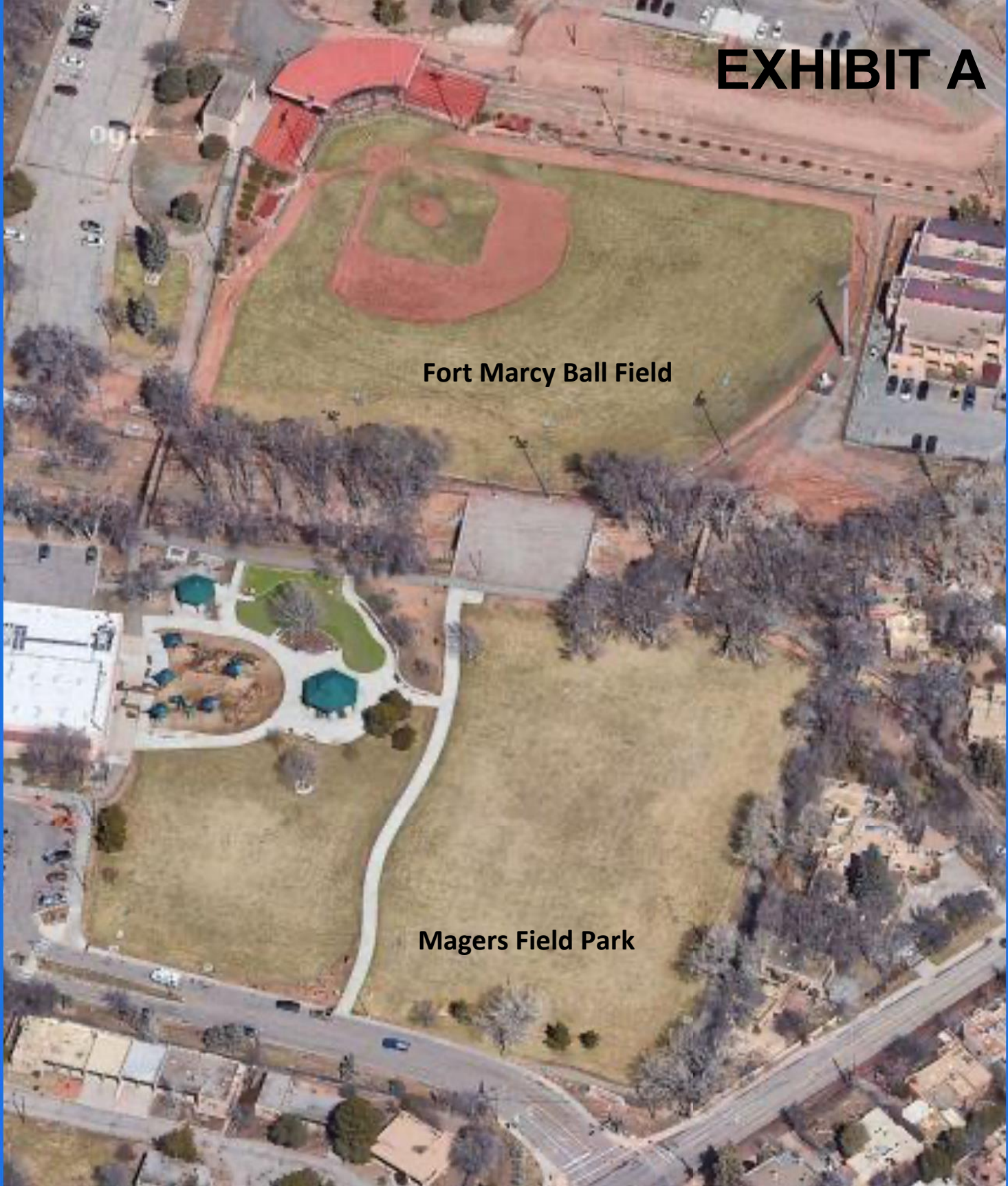
Magers Field Park