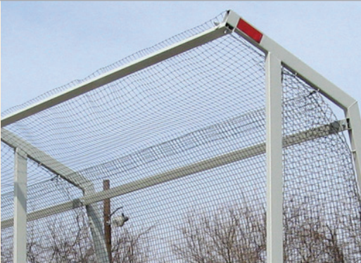
CANOPY and SIDE-NETS