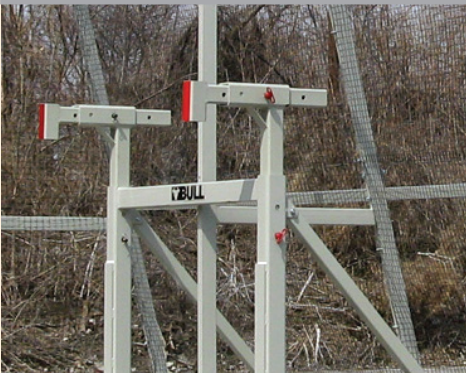
FULLY ADJUSTABLE HOOKS