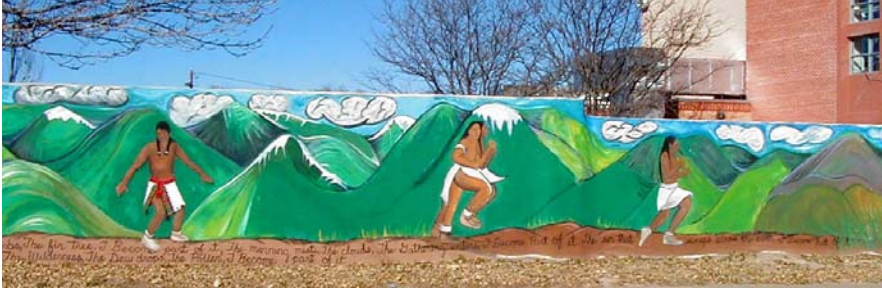
Letrado Street yard wall, partial view