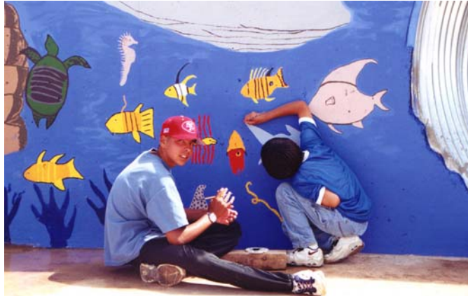
Animals of the World, 1999

Most of the nonprofit organizations, which act as fiscal sponsors for the projects [see page 46], are children and youth service providers. These include boys and girls clubs, family and youth shelters, youth counseling centers, group homes, etc. Some lead artists come to the CYMP with youth counseling experience. One lead artist, a foster parent, has worked with a group of Native Americans – many of whom are in behavioral treatment programs. Another is a counselor with the local shelter for battered families and brings young artists together each year.