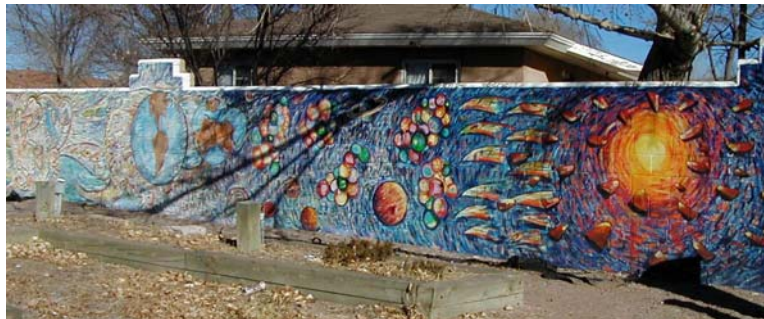
Santa Fe Civic Housing Authority Yard Wall