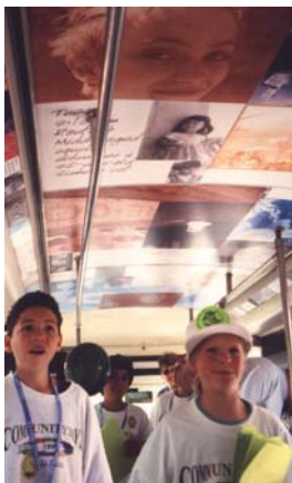
Santa Faces & Places Bus

In an effort to prevent ongoing graffiti on the yard wall at this site, the city's Parks and Recreation Department, the NM Department of Labor [DOL], and the Sangre de Cristo Girl Scouts teamed up to work with the youth artists to create this expansive spray-paint mural. After a meeting with the staff of the DOL, the youth artists decided to focus their work on DOL's "Pillars of Character." They painted words on the wall, including "Integrity," "Justice," and "Responsibility." They also included images of jobs in New Mexico in the imagery, including jewelry making, stucco plastering, and nursing. The goal of involving young graffiti artists in this program was to gain recognition for their artistic talent, pay them for their work, and instill a sense of pride and ownership toward deterring them from placing more graffiti on public and private property.