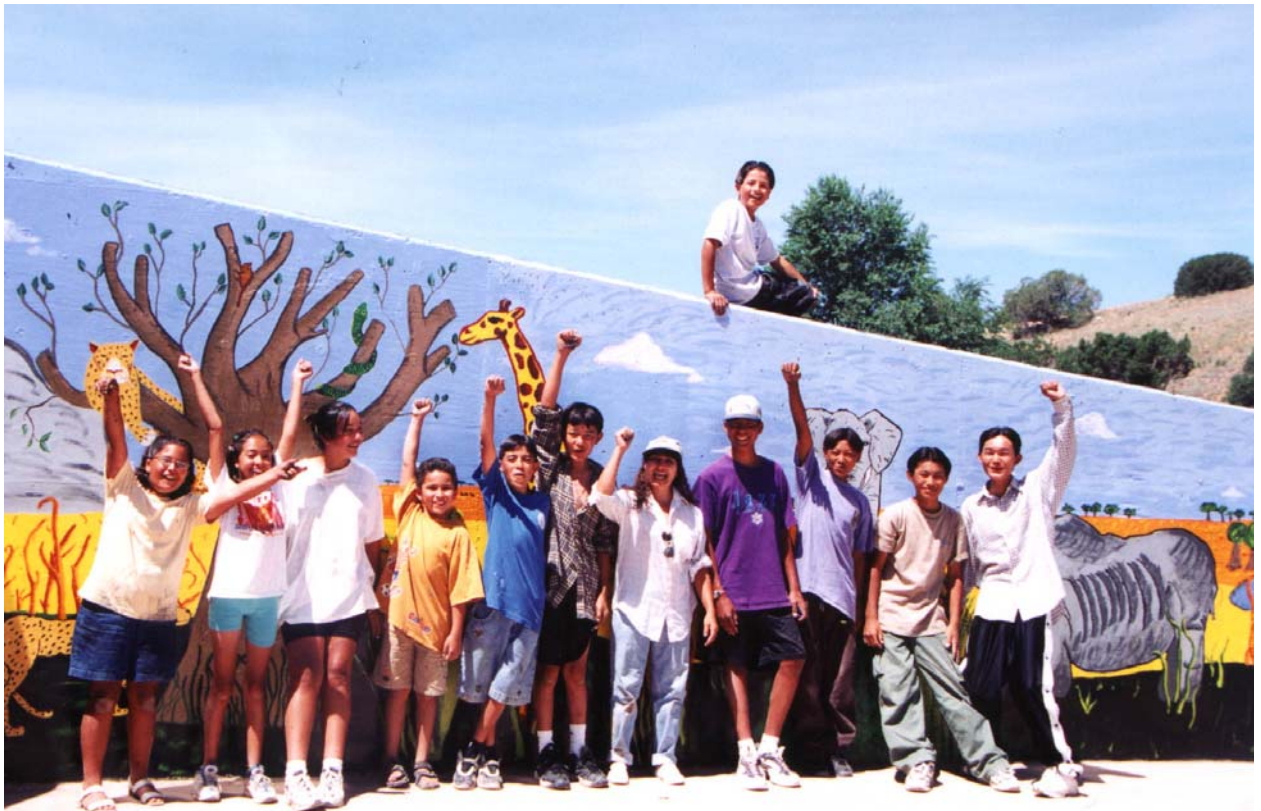
Animals of the World, Tierra Contenta Drainage Structure, 1999