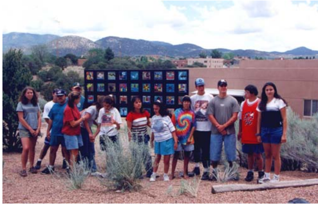
Fused Glass Sculpture, 1997

equivalent to at least 15% of each project budget, often over 60%. A small portion of the annual budget is set aside for mural repairs.