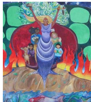
detail, north panel