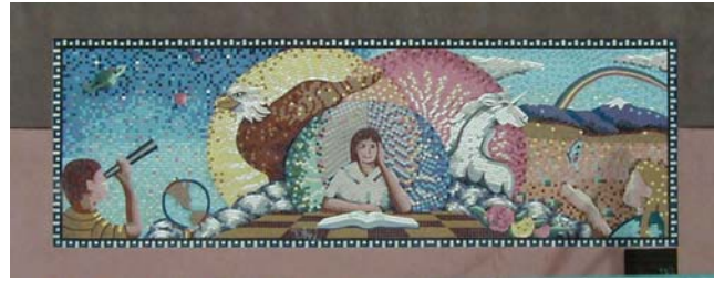
Monica Roybal Center