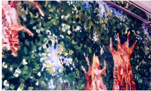
detail of Tree Bus