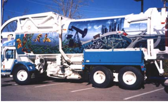
Consumer Cycle Truck