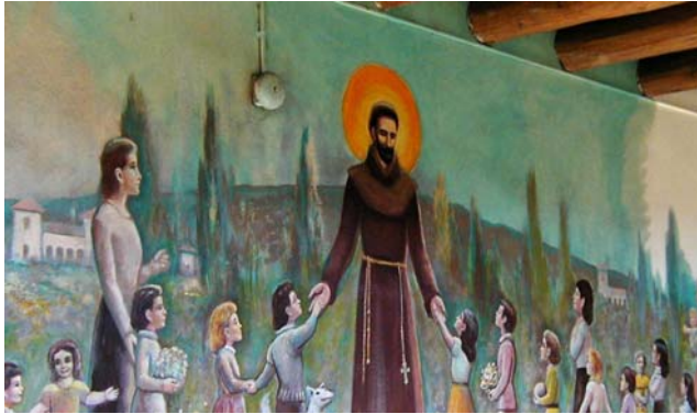
St. Francis Cathedral School Portal