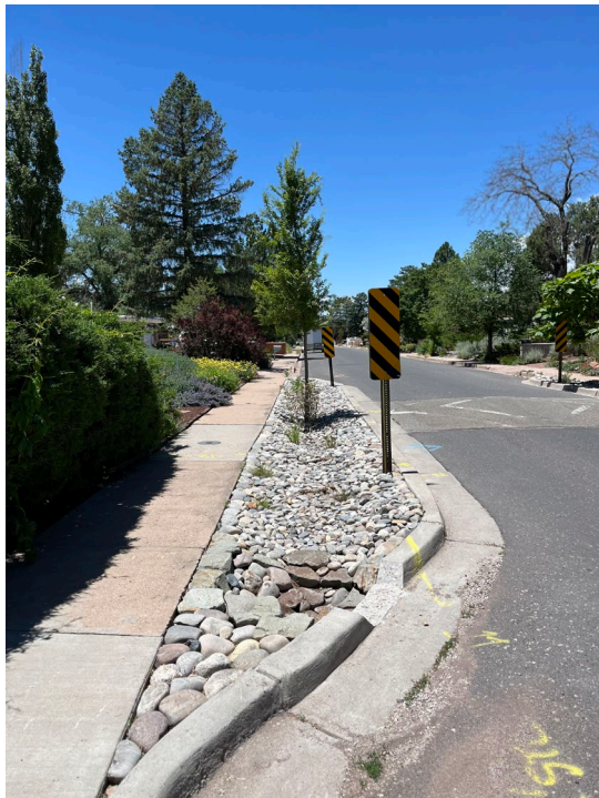
Valley Drive Rain Gardens, 6/15/2024