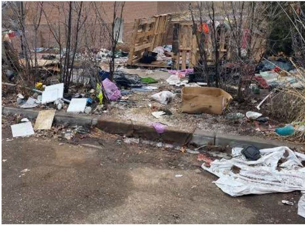
Park Ranger Cleanup Before, 3/25/2024