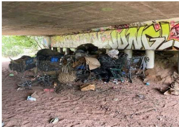
Park Ranger Cleanup Before, 3/04/2024