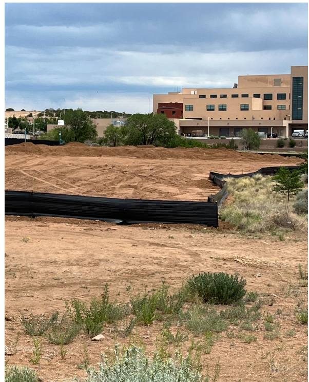
Construction Site BMPs at Los Soleras, 6/24/2024