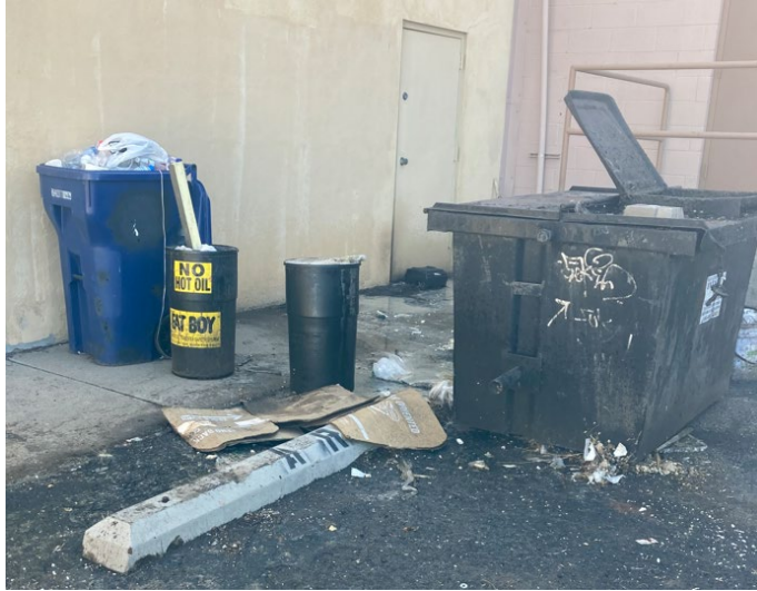
Illicit Discharge NOV issued 6/18/2024