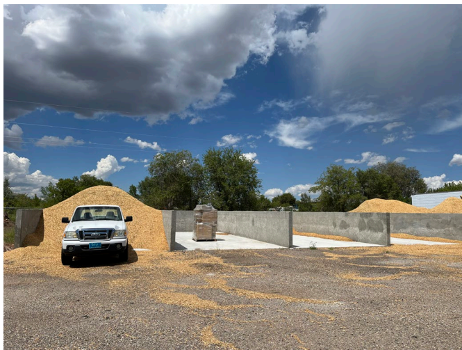
Newly built bays for mulch and other landscape materials to prevent wind and rain migration to storm system, Siler Yard Complex, 2024