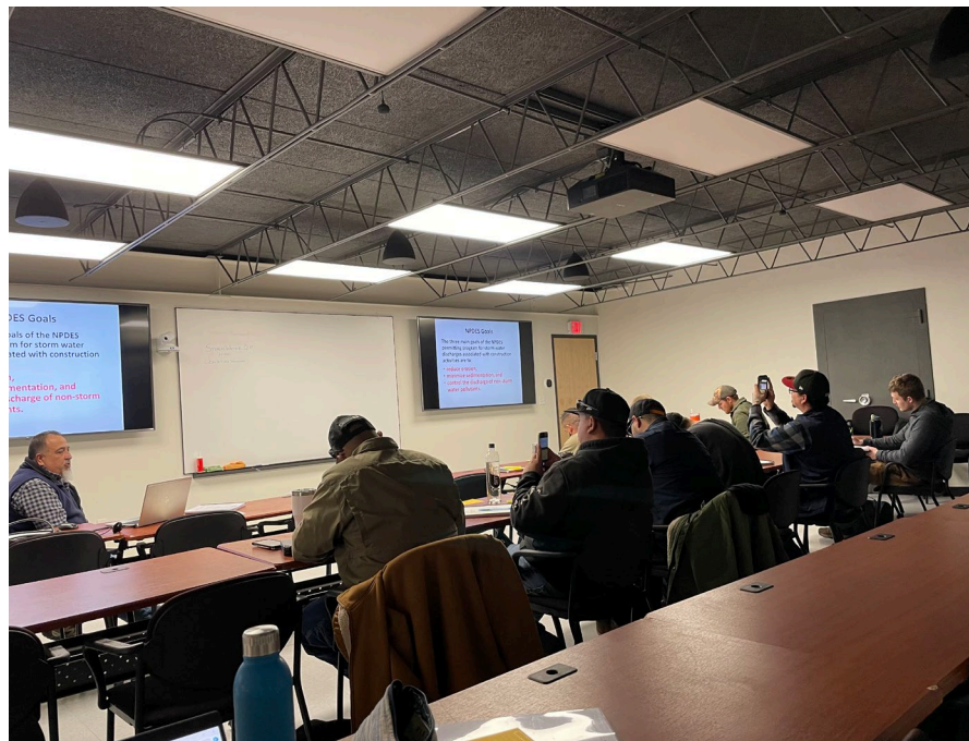
Stormwater Inspector Training, 2/7/2024