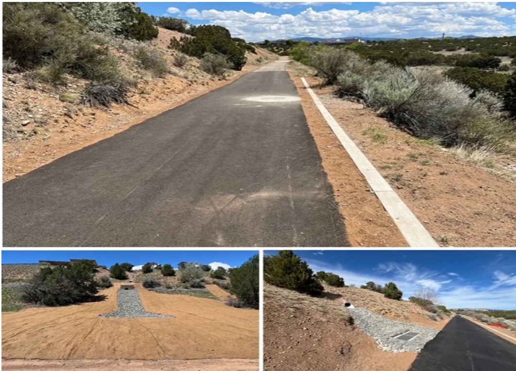
The Tierra Contenta Trail Repair to stop erosion and undermining of trail along the Arroyo de los Chamisos. 6/30/2024