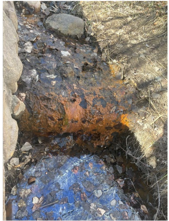
Illicit Discharge report: natural organic compounds, no violation found, 2/28/2024