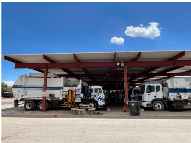
Covered parking for Environmental Service Vehicles, Siler Yard Complex 2024