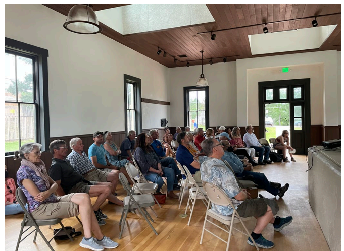
Benefit of Environmental Flows (2023 River Talks Series)