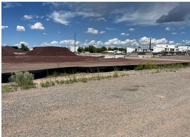
Silt fencing around salt and cinder yard prevents migration to the storm drain system, Siler Yard Complex 2024