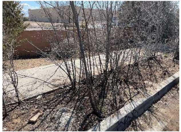
Park Ranger Cleanup After, 3/25/2024