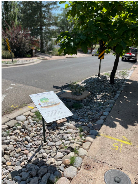
Educational signage at Valley Drive rain gardens, 6/29/2024