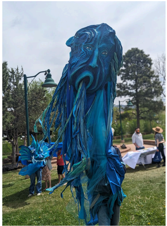
Public Art, 2023 Love your Watershed Day