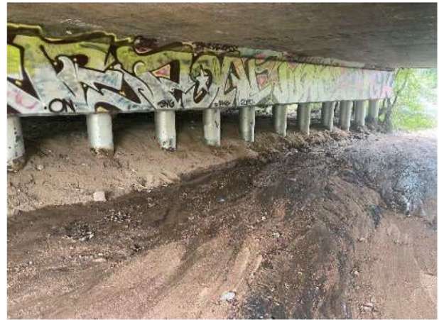
Park Ranger Cleanup After, 3/04/2024