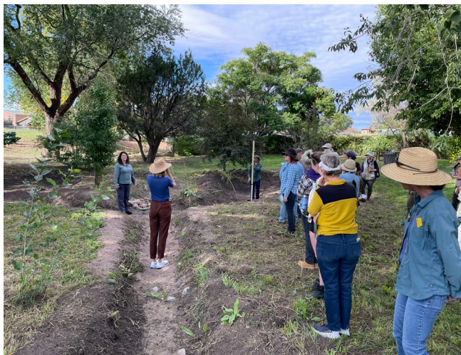
Rain Garden Maintenance Workshop