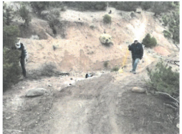
Arbolitos Trail, Redefining the tread on the Big Dip after some damage by storm drainage and an ATV incursion, Nov. 6