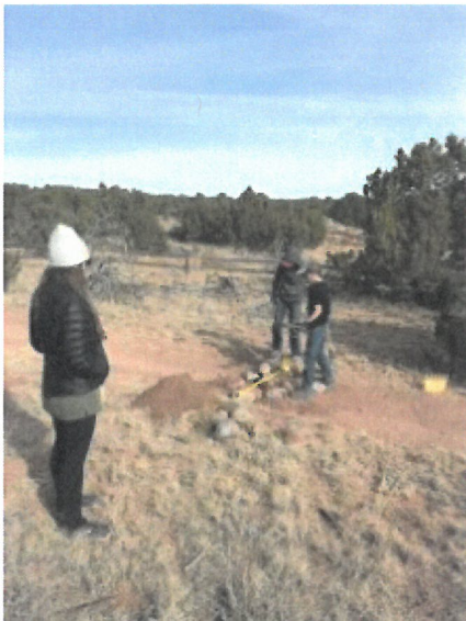
Journey Montessori students work to keep a grade reversal high enough to divert water but low enough to smoothly join the high side of the tread, Nov. 15