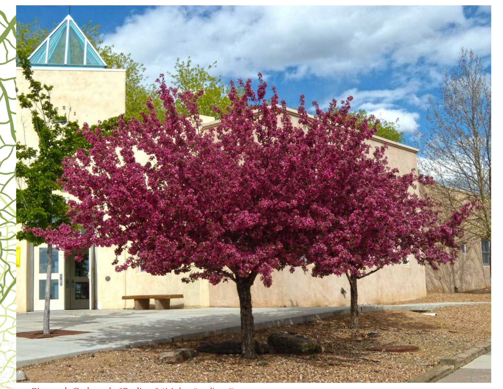
Pictured: Crabapple "Radiant" (Malus "radiant").